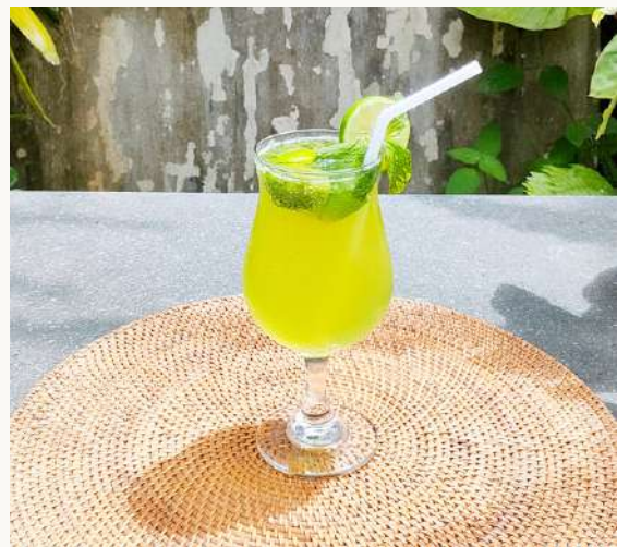
The Green Dreams

Bacardi, melon liquor, white grape, lime wedges, white sugar, sweet sour topped with sprite