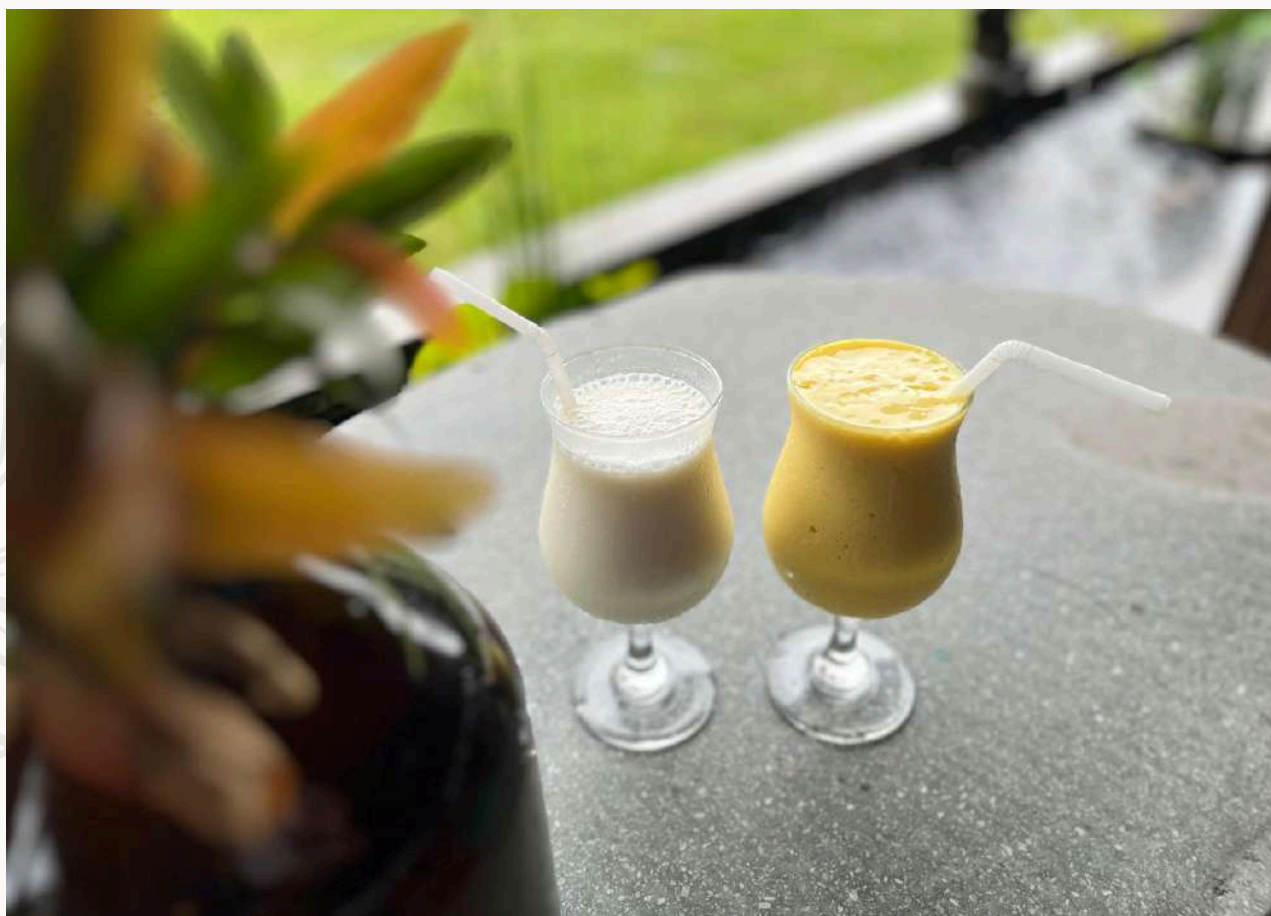
Sweet Lassi & Mango Lassi

Indian Tea (Hot/Cold) 41K/46K Ginger, milk, tea