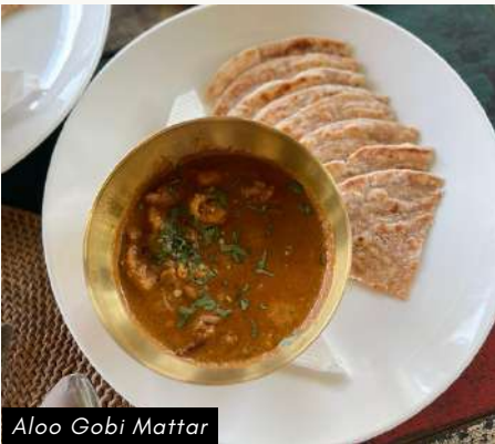
Aloo Gobi Mattar