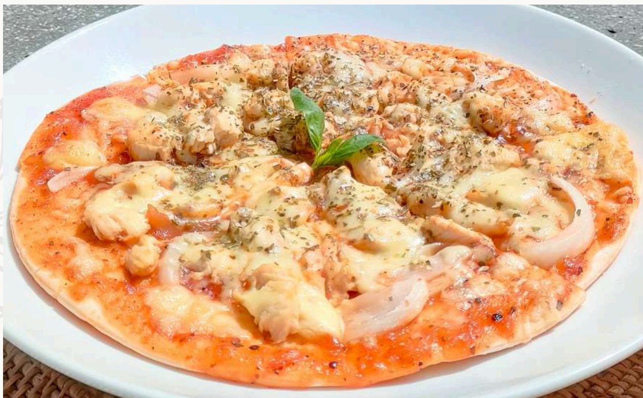
Pizza Chicken Barbeque